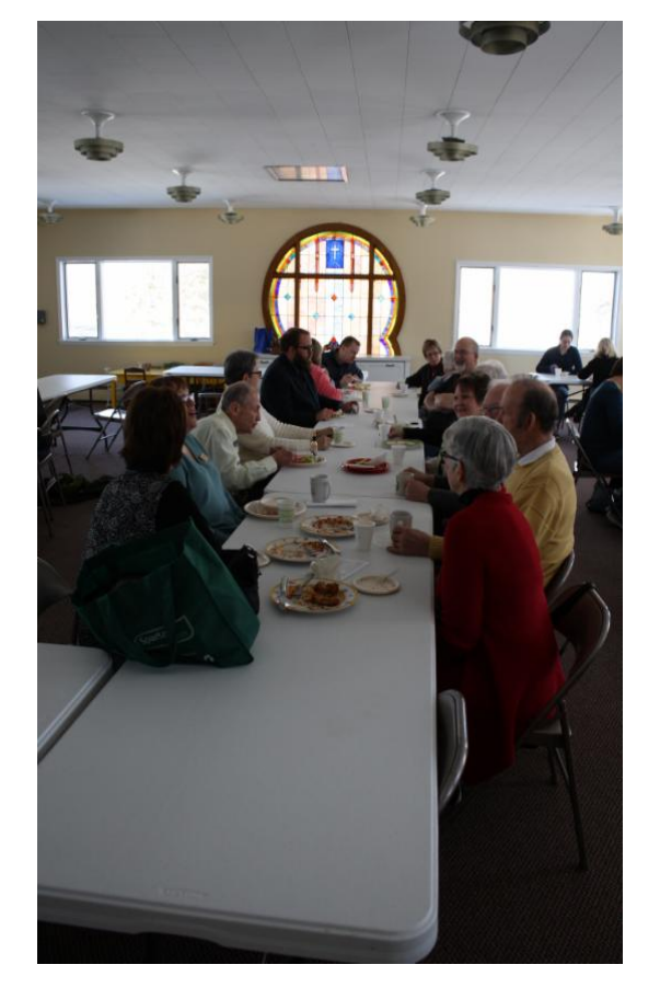
January 2016 POTLUCK